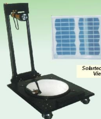
Solartech Under Vehicle Viewing Mirror