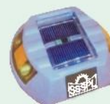
Solartech Road Studs