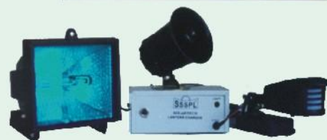
Solartech IR Sensor With Hooter & Halozen Light