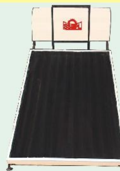
Domestic Solar Water Heating System

(Heat Ex-changers for deserts/hilly areas to solve hard/ salty water problem & freezing problem by use of soft water & anti-freezing solutions respectively.