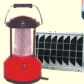
Solartech Mini Lantern LED