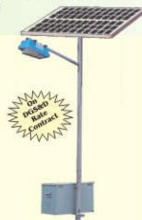
Solartech Security/Street Light