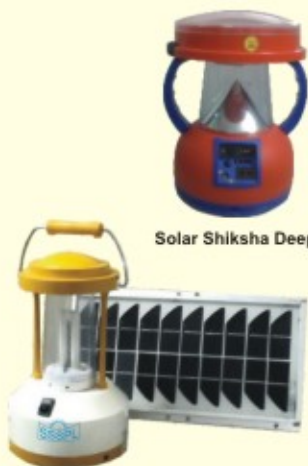
Solar Shiksha Deep