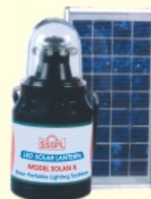
Solartech Solan-8 S or Solan 12 S