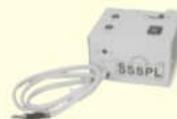
SLCON 3-6-9V (DC-DC converter)