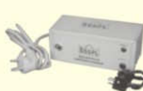
SLAC-12 (AC-DC Converter)